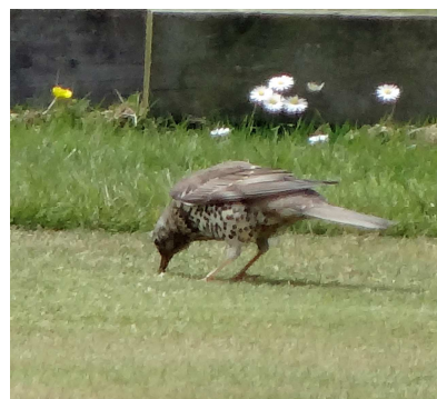
Caught damaging the lawn!