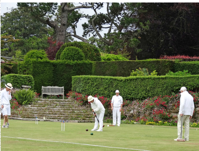
Level Play match in the beautiful setting of Kingston Maurward Gardens, nr Dorchester.

During 2015 many members have been observed engaging in a new game. It can be played by several players and involves them working together towards a common end. The players are divided into two separate groups - 'pointers' and 'placers'. 'Pointers' must scour the lawns in search of pairs of holes. Once they find a pair they must remain in situ and await the arrival of a 'placer' (see 2nd person from the left, above). The 'placer' must drop the appropriate metal hoop into the two holes as carefully as possible. It has been noticed that advanced players seem able to take on the roles of pointer and placer simultaneously, although this occurs normally when fewer players are taking part. The game is over when a short, white pole with coloured stripes at the top is placed in a single hole in the centre of the lawn. Players who finish this game in under 10 minutes are rewarded by being allowed to play croquet on the lawn."