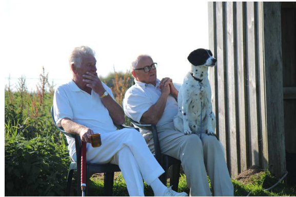
It's a dog's life! Watching the Dowding Cup final.