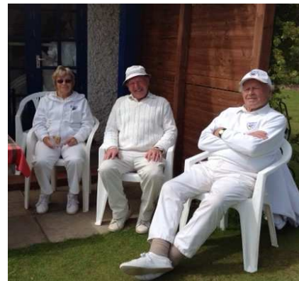
Members of Porthpean GC team enjoying a chat with the team captain from Exeter club.