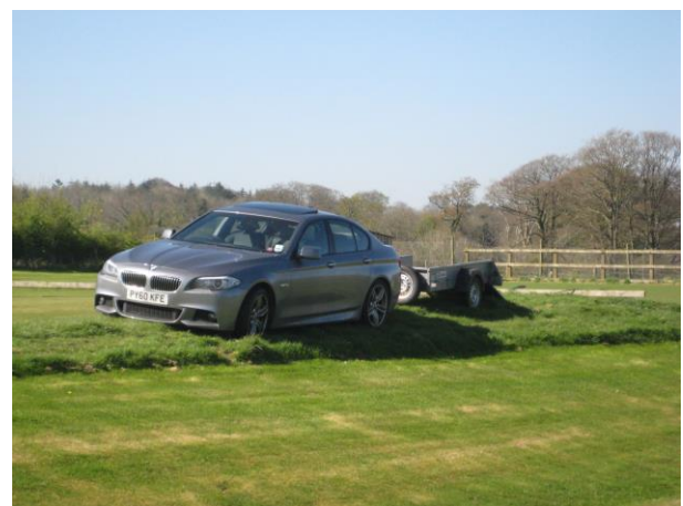
You rely too much on your GPS, Peter!