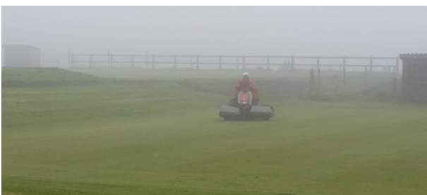
Russell disappears into the mist, searching for grass to mow.