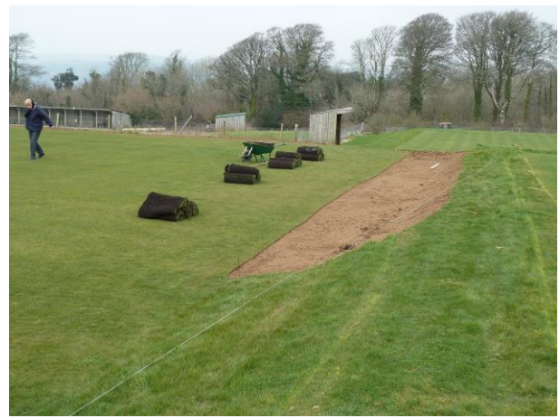
Ready to lay turf on lawn 3