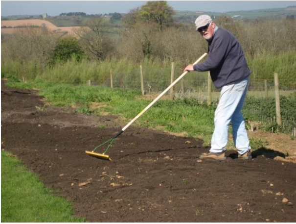
“What about the workers”, I hear you cry!