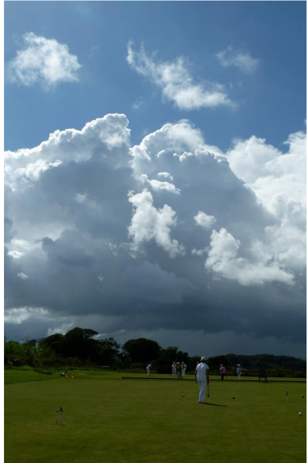
Just a reminder – this is what a threat of rain looks like!

And finally Please let us know of any ideas for winter social events.